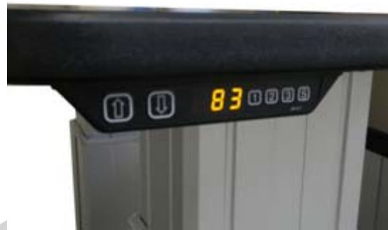
Optional position display with 3 memories (ref : BCHPOS)